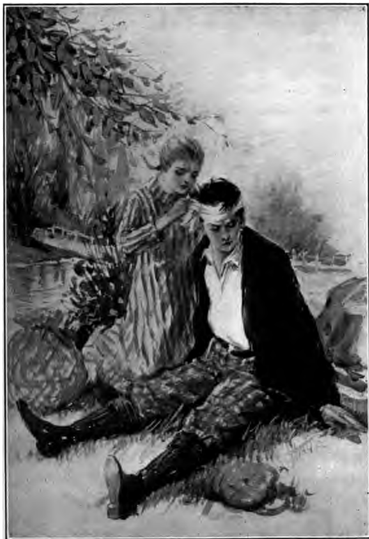
He drank deeply, then struggled to a sitting posture, his face whitening beneath its tan.